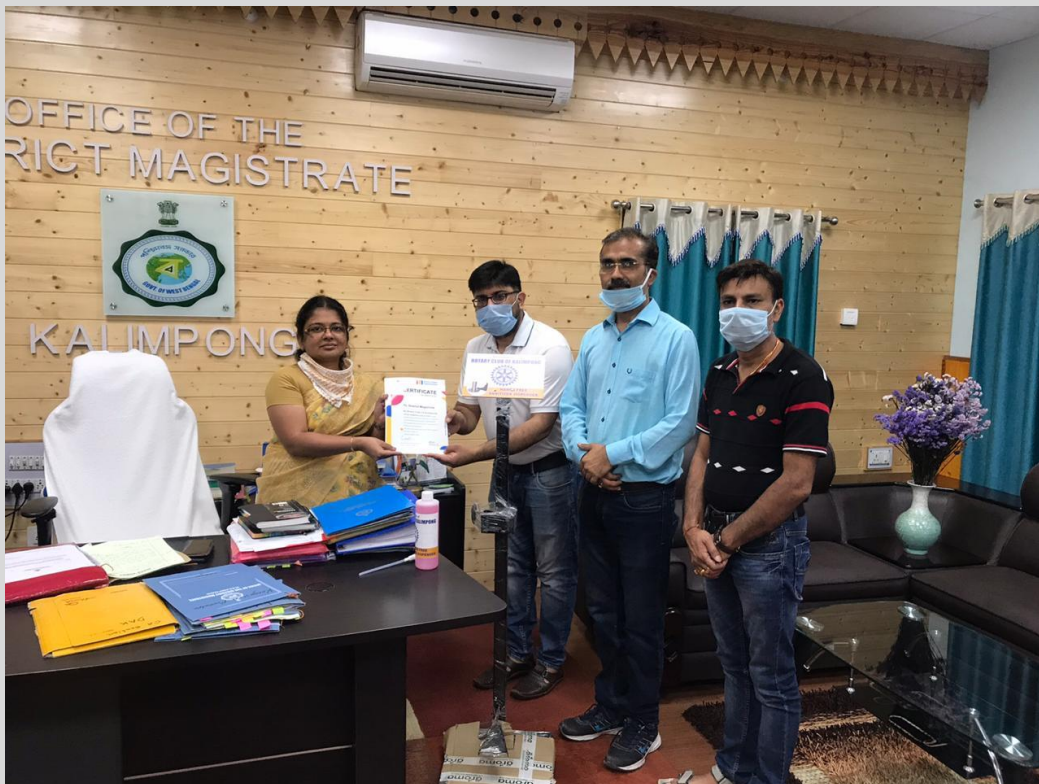
Distribution of Hand-free sanitizer at the D.M.'s Office