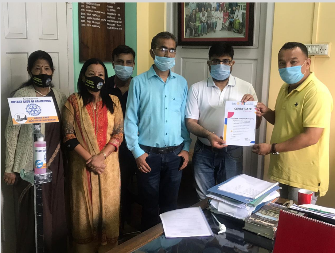
Distribution of Hands-free sanitizer at Kalimpong Municipality