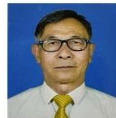
Rhonbu Fudong Spouse